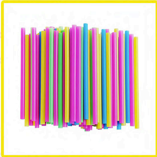
coloured plastic straw