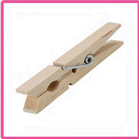
wooden clothes peg